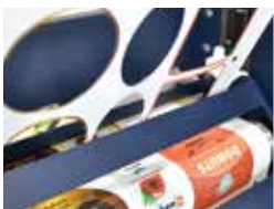
waste matrix removal