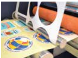
waste matrix removal