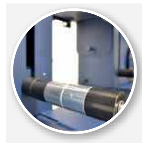
Ultrasonic tension arm