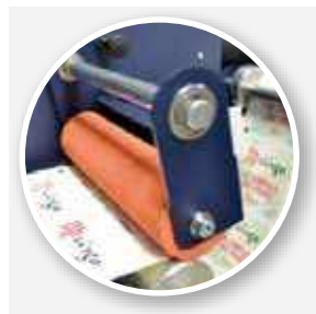
Sponge pressing roll